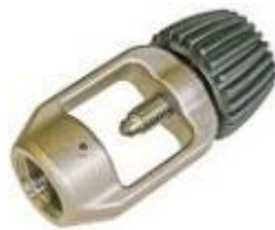
International filling connector