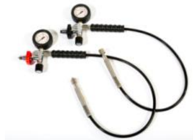
Filling device PN200 (black) and PN300 (red)