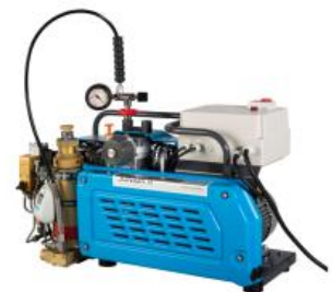
JUNIOR II-E with automatic condensate drain system and control box

The automatic condensate drain removes water from the intermediate separator and the final separator automatically during both operation (every 15 minutes) and shutdown. In addition the compressor is switched off automatically when the final pressure is reached.