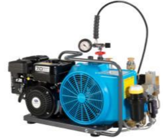
JUNIOR II-B with automatic condensate drain system

The automatic condensate drain removes water from the intermediate separator and the final separator automatically during both operation (every 15 minutes) and shutdown. In addition the compressor is switched off automatically when the final pressure is reached.