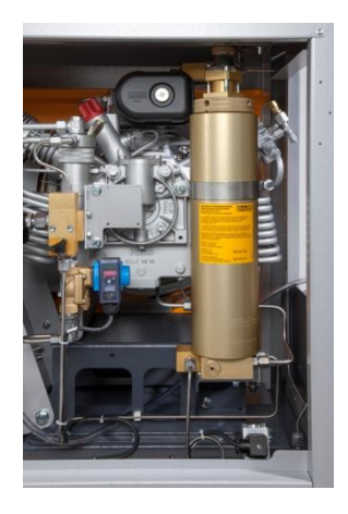
Automatic condensate drain system

Compressor control including automatic condensate drain system and automatic switch off at final pressure.