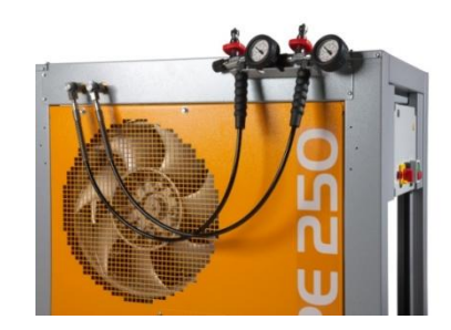
PE-HE with filling hoses