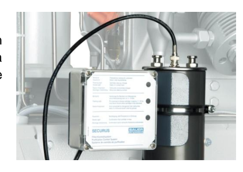
SECURUS Filter Cartridge Monitoring System