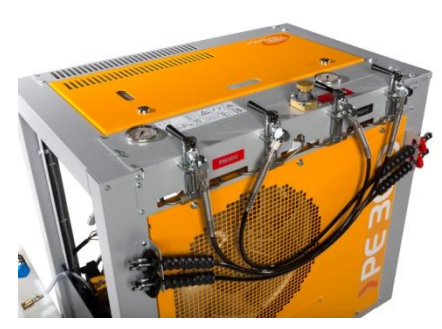
PE-HE mit Füllschläuchen 2x200 bar und 2x300 bar