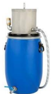
40 l Condensate collection system