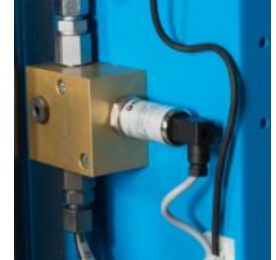
Dew point sensor

Dew point sensor for continuous measuring of the pressure dew point; installed downstream after the purification cylinders. Consisting of dew point sensor, mounting adapter, cable and installation.