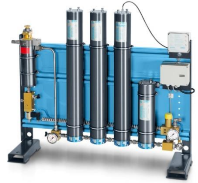
P100/350 / 350 bar with automatic condensate drain and SECURUS