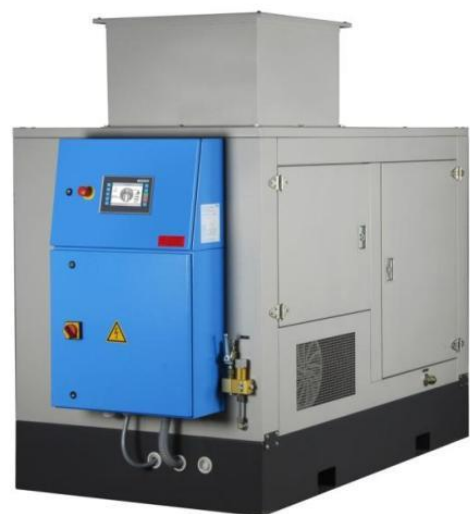
Compressor K 22.x with Super Silent housing

Super Silent housing only available in combination with compressor control B-CONTROL III!