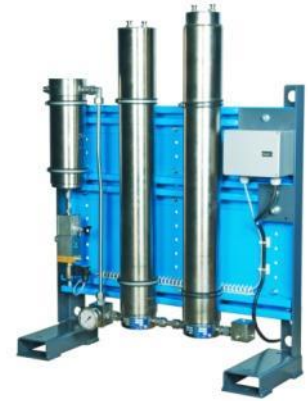
P80/350 / 550 bar with automatic condensate drain