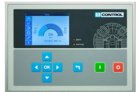
B-CONTROL MICRO Display

The B-CONTROL MICRO is a modern, easy-to-operate compressor control unit with colour display that intelligently controls and all basic compressor functions and monitors their safety. User-friendly navigation and clear display of all main compressor parameters.