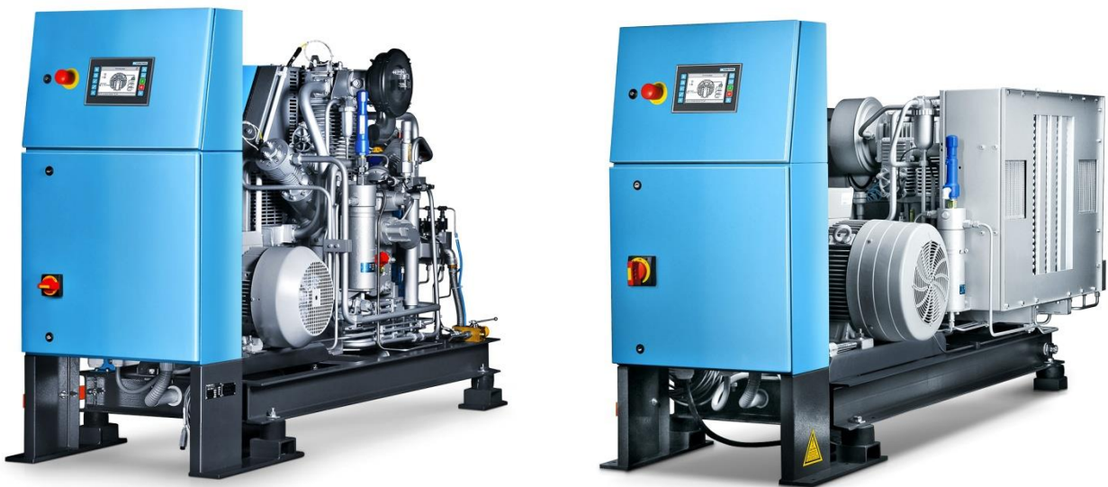
KAP220 and KAP23 with B-CONTROL II (optional)

KAP220-20-E | KAP220-25-E | KAP220-30-E | KAP23-40-E | KAP23-50-E