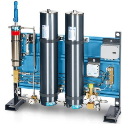
P120-He/350 bar with automatic condensate drain and SECURUS